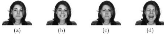
Fig. 2. Sample images for one subject of the AR database [10].

The AR face database [11] is used in the experiments, which contains over 4,000 color face images of 126 people's faces, among them, a subset of 400 images from 100 different subjects was used. Some sample images are shown in Fig.2.